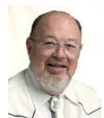
Zone Chair Ley

When you are done, you might think of "what might be missing" if it wasn't for you!