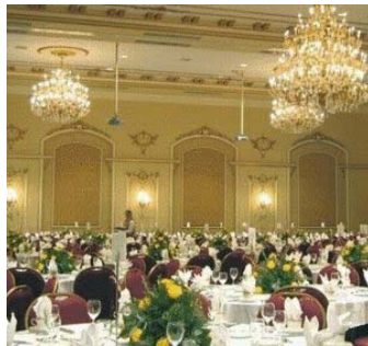
Davenport Hotel, Spokane