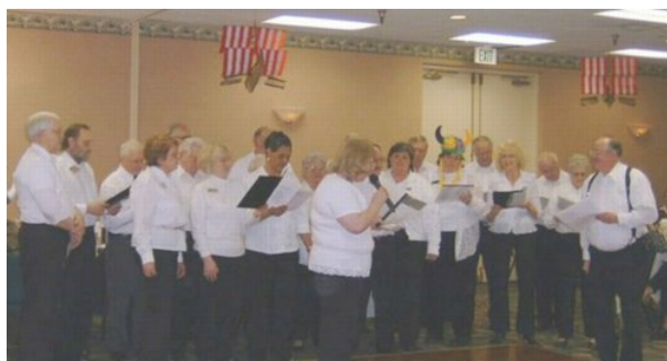
The District C Chorus